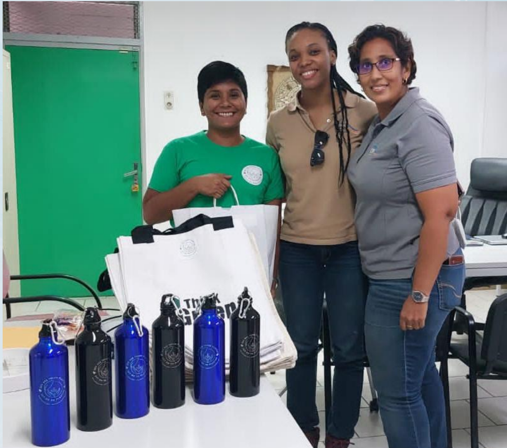
SUWAMA and the BCRC-Caribbean teams

In October 2022, the BCRC-Caribbean and SUWAMA teams met in Paramaribo, Suriname. This marked the first in-person meeting of the teams after working together virtually since 2020. Topics discussed at the meeting included progress made and lessons learnt.