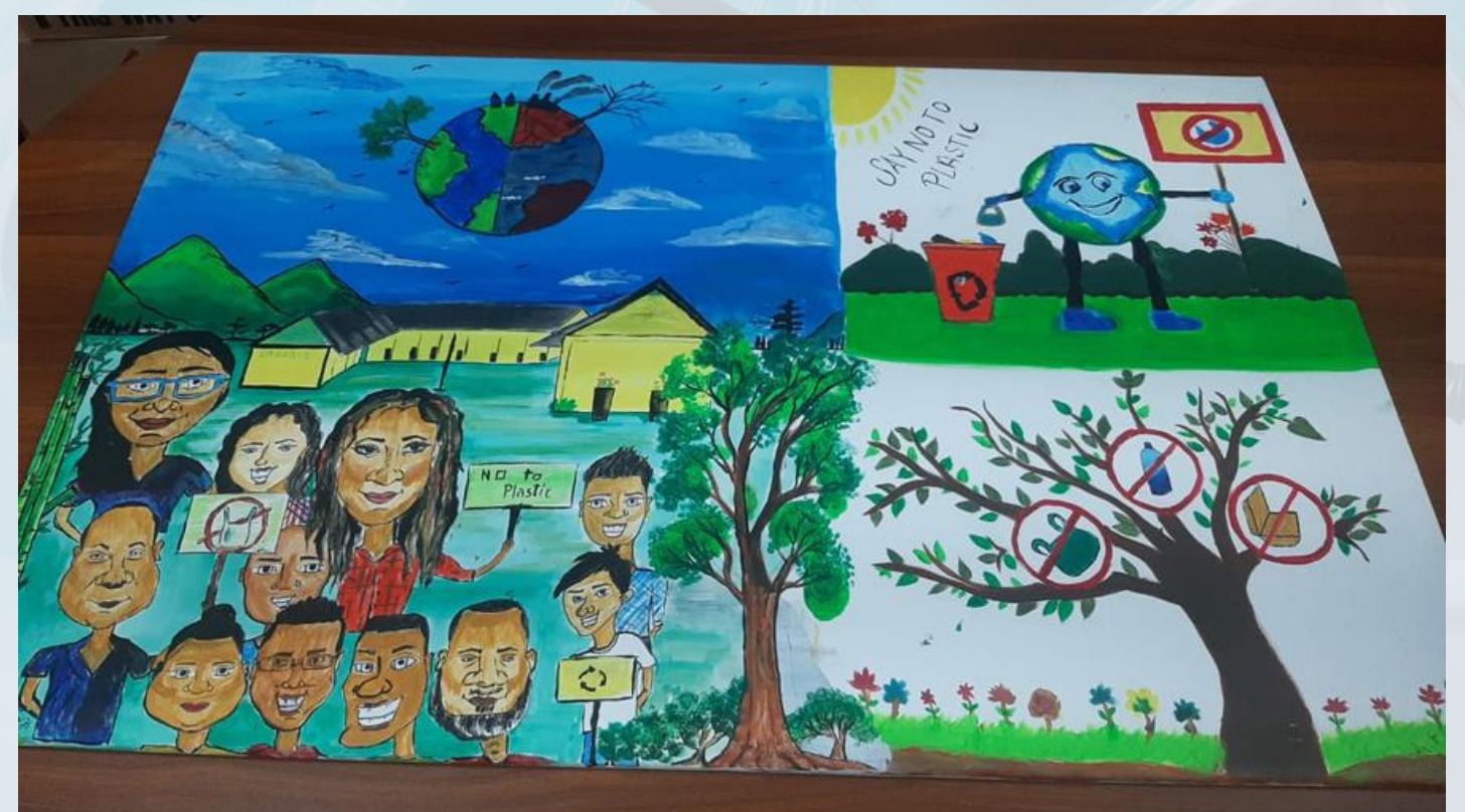
Artwork created by students at the 3 high schools

Activity 4 was completed by the effectiveness of the developed zero-plastic plans being evaluated through a second waste audit and questionnaire. SUWAMA found that two (2) of the schools met the activity target to produce 50% less SUP waste, however, it was noted this result may have been because there were less students present at the schools when the waste audits were done. The third school was found to have an increase in the segregation of SUP waste for recycling, which indicated the students had become more aware of why SUPs should be separated from other waste. Overall, positive changes in the behaviour and awareness level of students regarding SUPs prevention and recycling were observed, indicating the success of this activity!