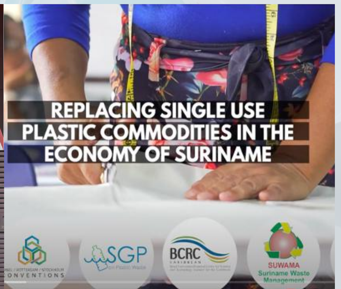
Promotional Video created by Srapu Studio (part of BOSROKO Group)