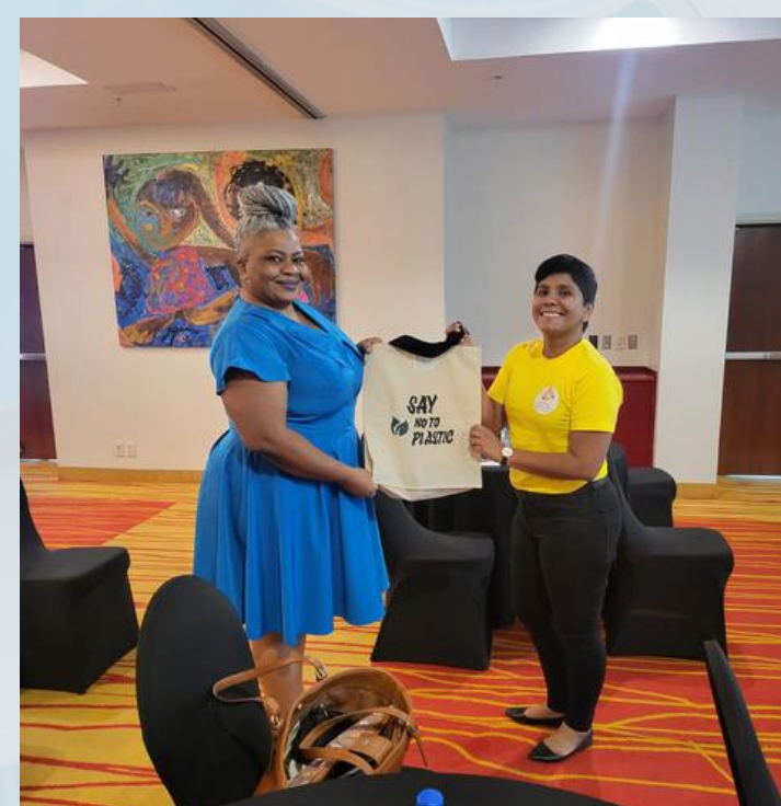
SUWAMA and Presentation Participants