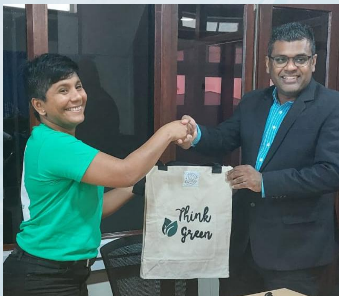
SUWAMA at the Ministry of Spatial Planning and Environment

The sale of the reusable cloth bags was initiated in August 2022 and was supported by the promotion of the bags through the Promotional Videos , which were broadcasted on a variety of television stations in Suriname. The bag sales were also accomplished through door-to-door sales, approaching companies and SUWAMA's partners, advertising on Facebook, and sales at markets and fairs.